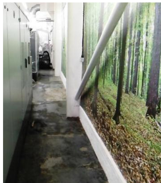
(SPM) Intelligent Print & Communications required a trafficable surface to the print