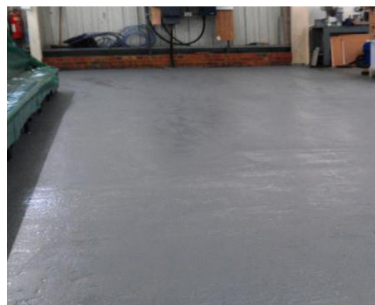
Preparation, floor repair and application can all be done in 48 hours