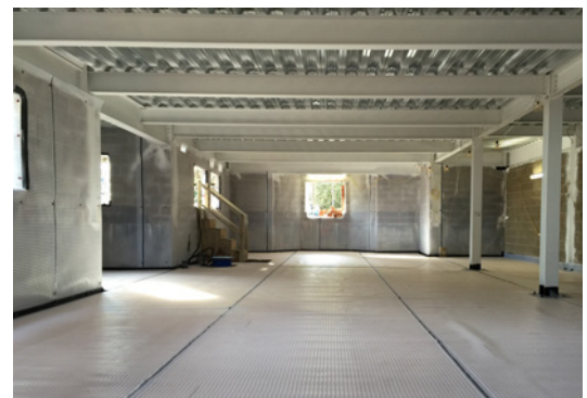
Newton 508 cavity drain membrane applied on top of the closed cell insulation