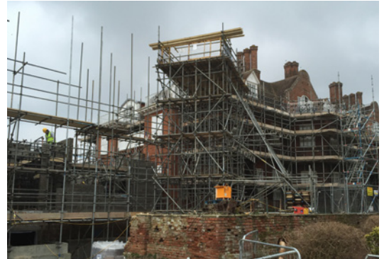
Grade 2 Listed Pickenham Hall, Norfolk

"Kier Construction were extremely happy with our performance completing the works two weeks ahead of schedule in this 3,000 square foot basement." - Anthony Gooch (Newton Specialist Basement Contractor)