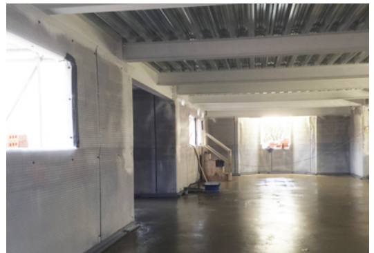
65mm of screed applied as a finish to the floor