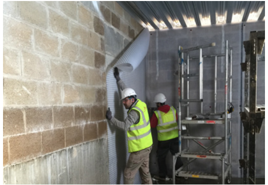
Newton 508 installed to the new extension walls