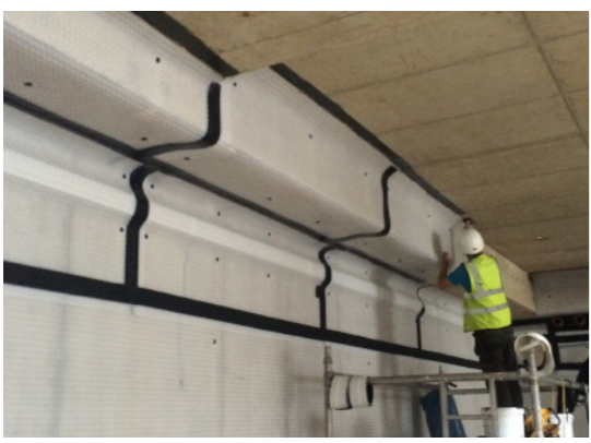
Case Study: Ground Gas Protection and Waterproofing: New-Build Mansion The Newton PAC-500 was the perfect solution for this large-scale new build basement project which included multiple swimming pools.