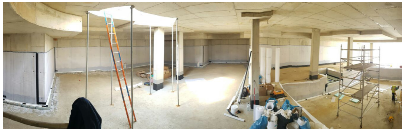
The Newton PAC-500 System is suitable for large and complex, multi-level structures

Where both ground water and ground gases are a potential risk, the Newton PAC-500 System has been developed, tested and proven to work. With any system that utilises a gas barrier, integrity of the barrier is critical, and so the Newton PAC System is tested using a patented trace gas integrity testing method to ensure that the membrane is guaranteed to be fully gas resistant.