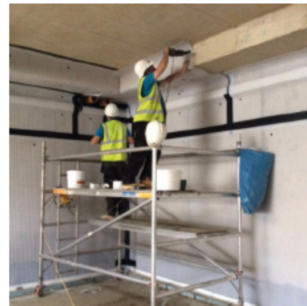
The Newton 508R that forms the air-curtain is neatly fixed to terminate at the soffit

The Newton PAC-500 System has been installed successfully in both new build and refurbishment projects.