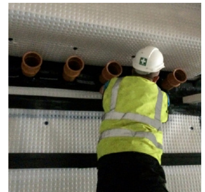
Penetrations through the membrane are carefully 'double sealed' to ensure gas tightness, ready for the trace-gas testing