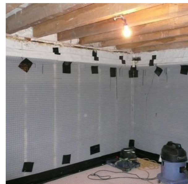
Newton PAC-500 System installed to a house in Derbyshire with very high levels of radon gas

Garry Whittall Contract Supervisor Carter Construction (Gloucester)