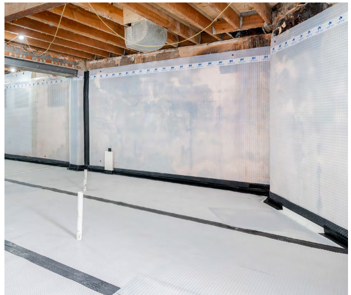
All joints between membranes are sealed with Newton Overtape.