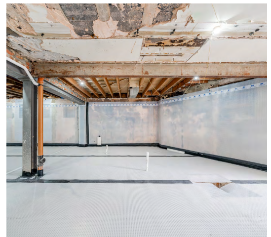
Existing columns made installation tricky at times