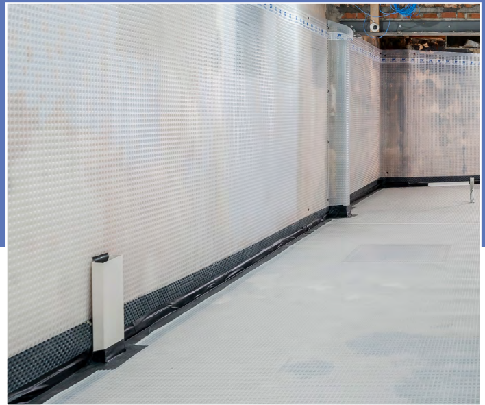
Inspection Ports ensure that the system is maintainable in future.

A high head and high to medium performance pump available in both automatic and manual versions. A reliable unit suitable for continual pumping of both rain and ground water.