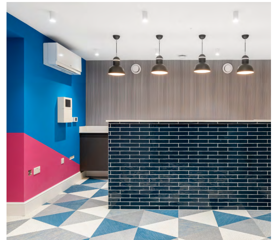
The new community centre reception

Regardless of this, Arti Construction completed the 280m 2 installation within budget in just one week, delivering a reliable Type C structural waterproofing system that is also compliant with British Standard 8102:2009.