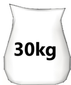
HYDROCOAT 1 SCREED 2K