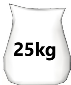
HYDROCOAT 1 RENDER